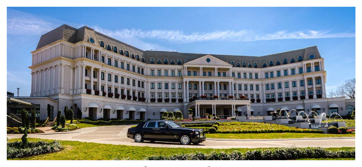
Sunday, September 22